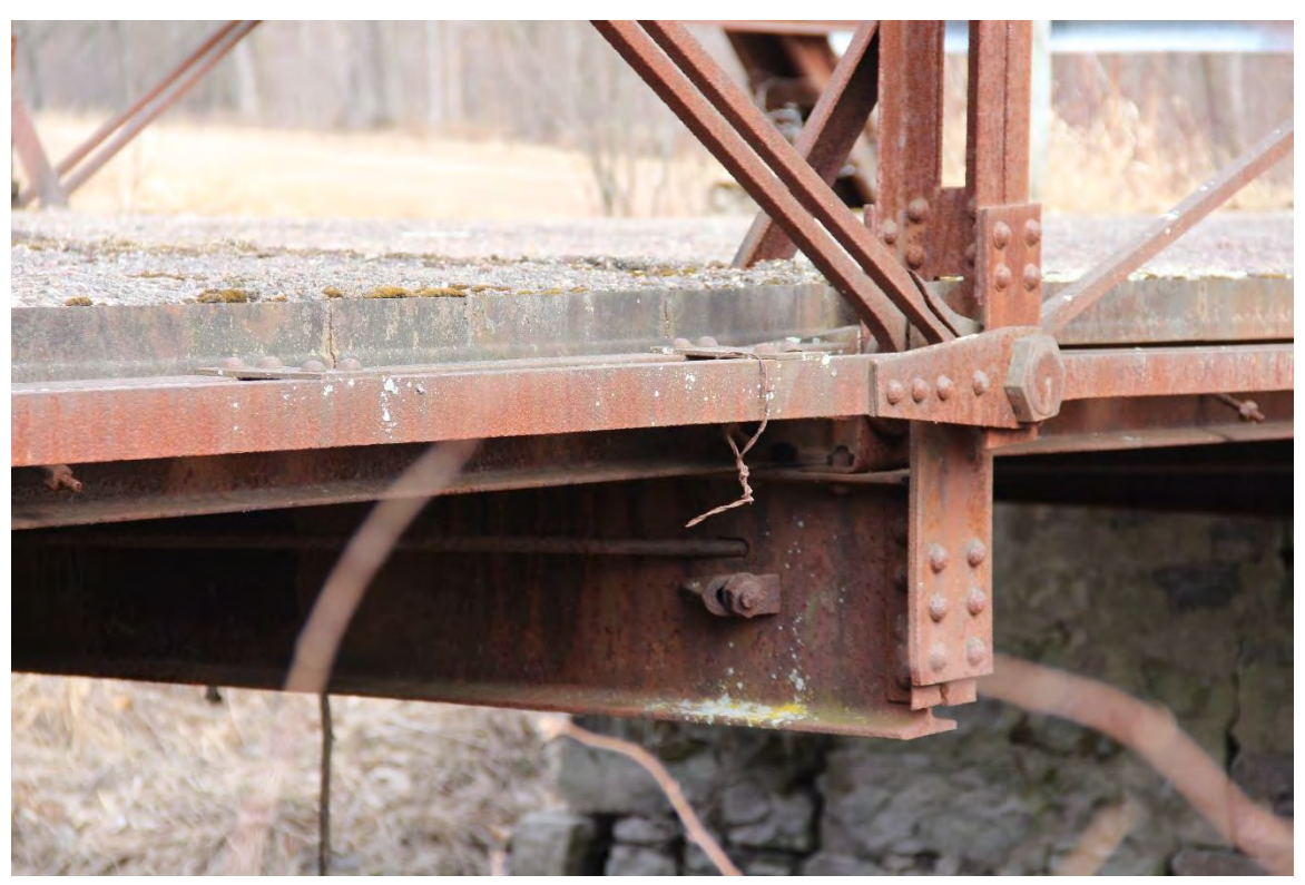
Photograph 6 of 11. Detail of pinned connection where bottom chord, main verticals, diagonals, and floorbeams meet.