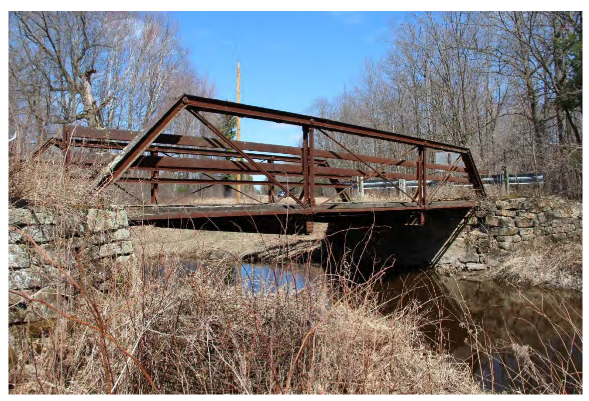
Photograph 2 of 11. Southeast elevation and abutments, view facing north.