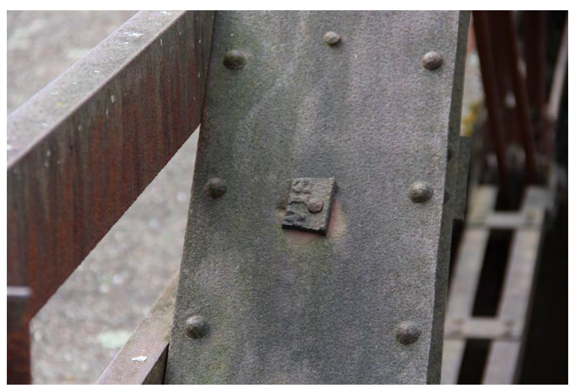
Photograph 10 of 11. Detail of bridge plate fragment.