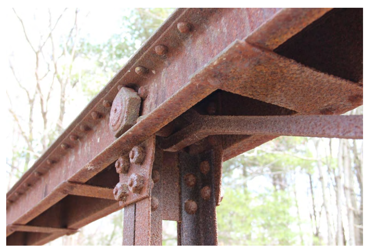
Photograph 3 of 11. Detail of top chord, major pin connection, and riveted and bolted members.