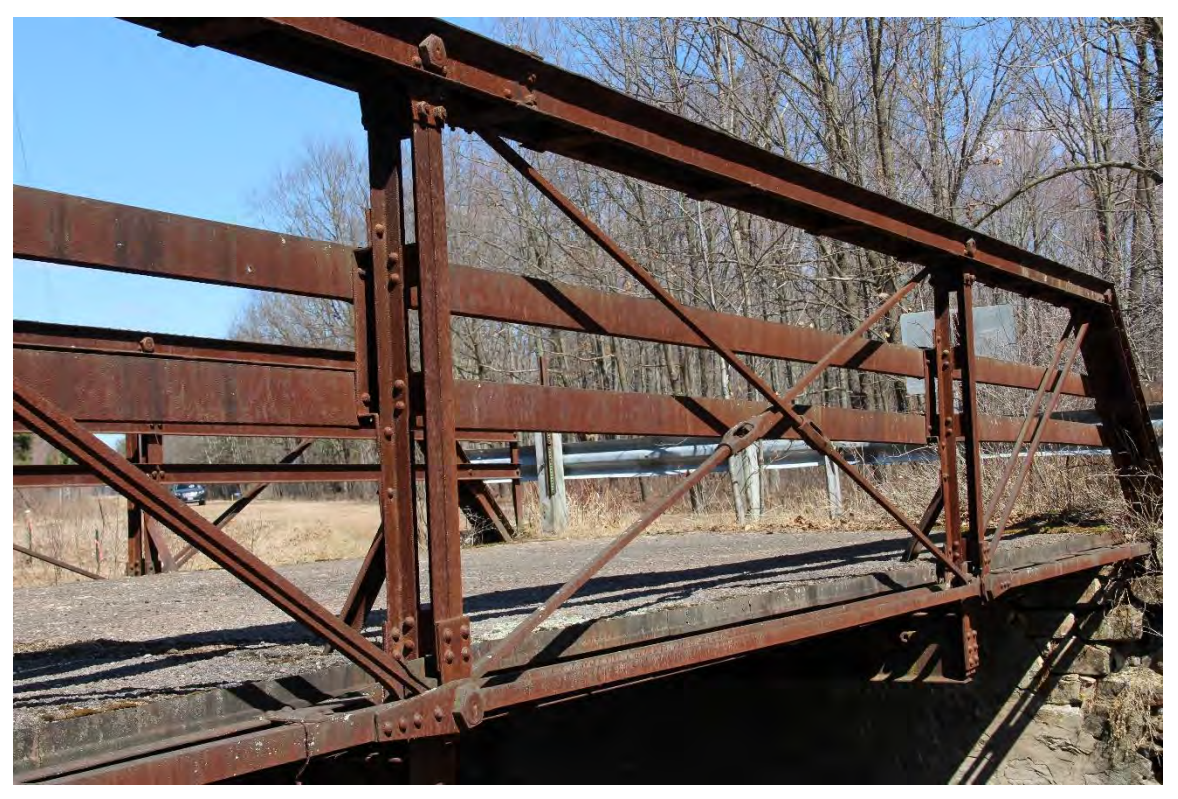
Photograph 5 of 11. Detail of central truss panel on southeast elevation, view facing north.