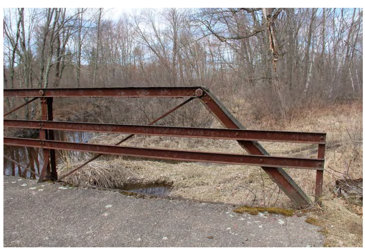
Photograph 9 of 11. Bridge railing, view facing northwest.