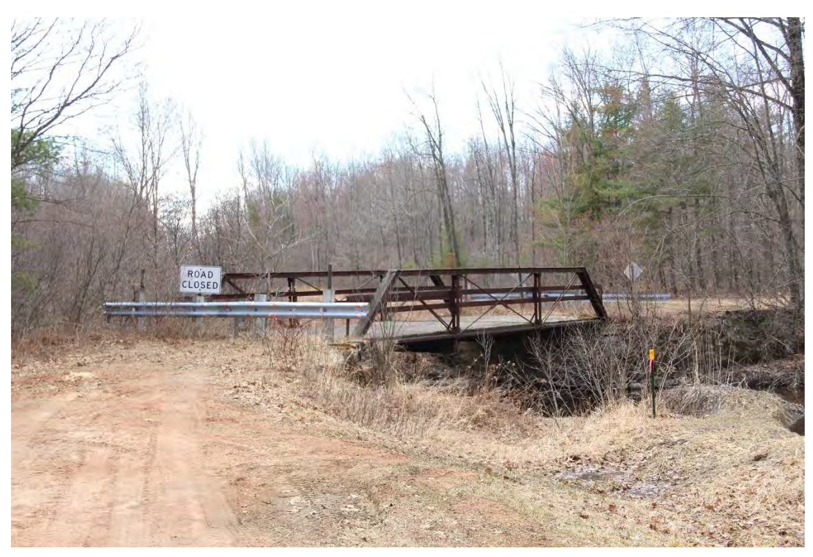
Photograph 1 of 11. Overview, approach, and northwest elevation, view facing south.