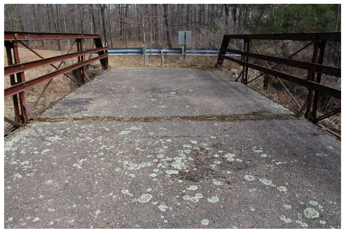
Photograph 11 of 11. Replacement deck with bituminous surfacing, view facing northeast.