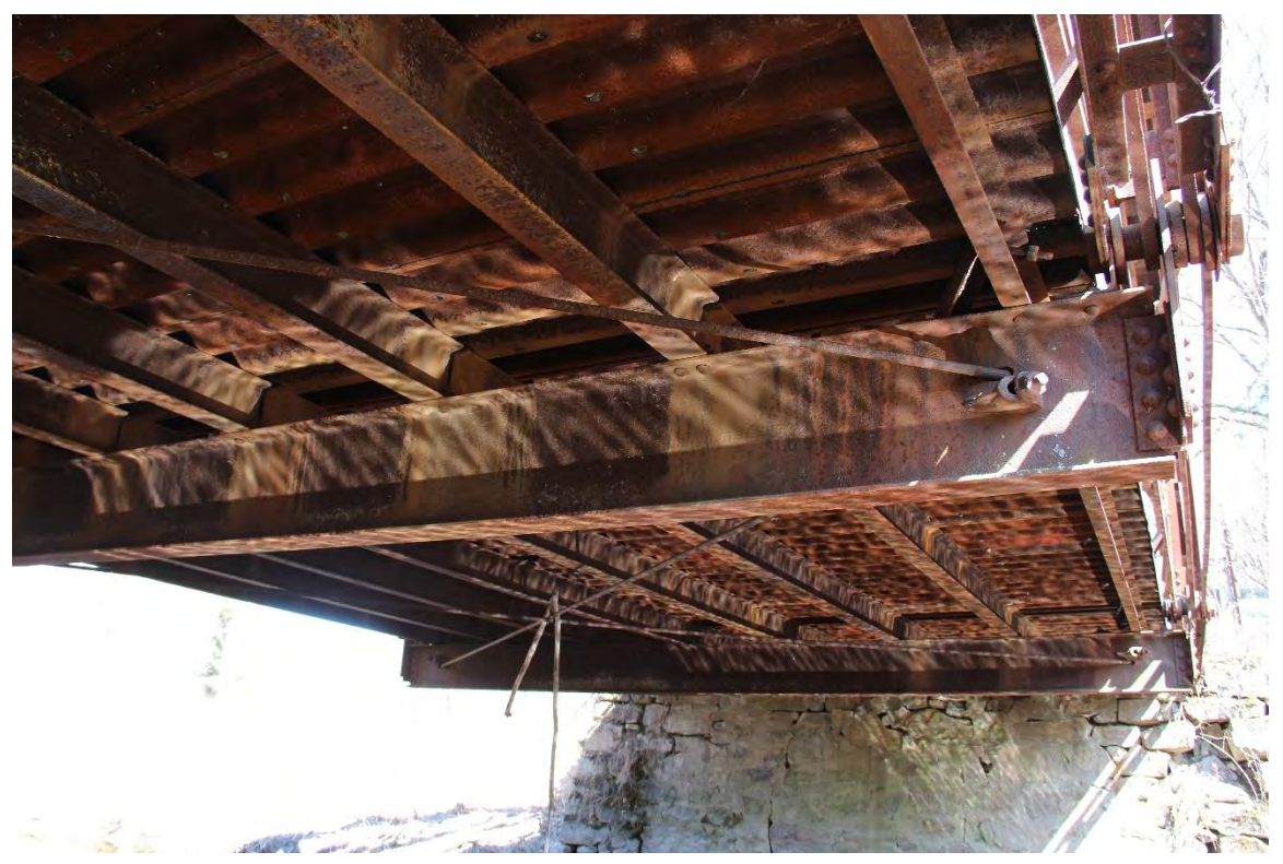
Photograph 7 of 11. Floor system with rolled I-beam stringers, floorbeams, and lateral bracing, view facing north.