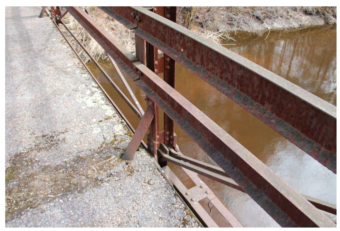
Photograph 4 of 11. Detail of bottom chord, vertical and diagonal members, and pin connection.