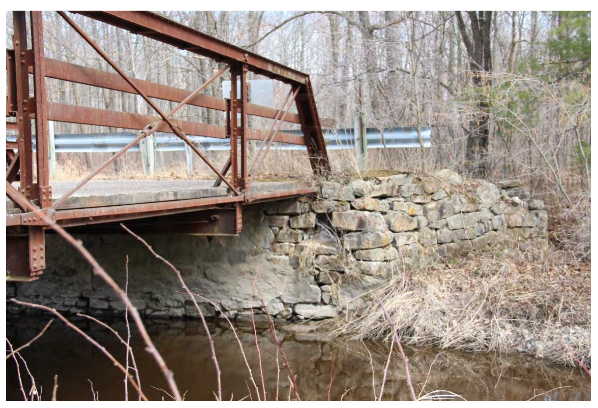
Photograph 8 of 11. Northeast stone abutment and wingwall, view facing north.